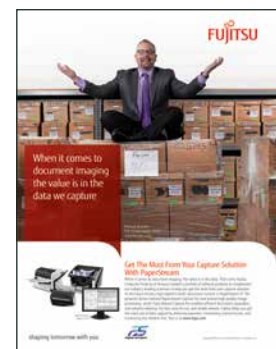
Fujitsu in this issue.