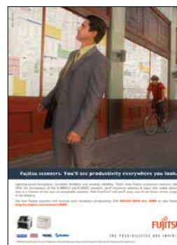
Fujitsu in May/June 2007 issue.